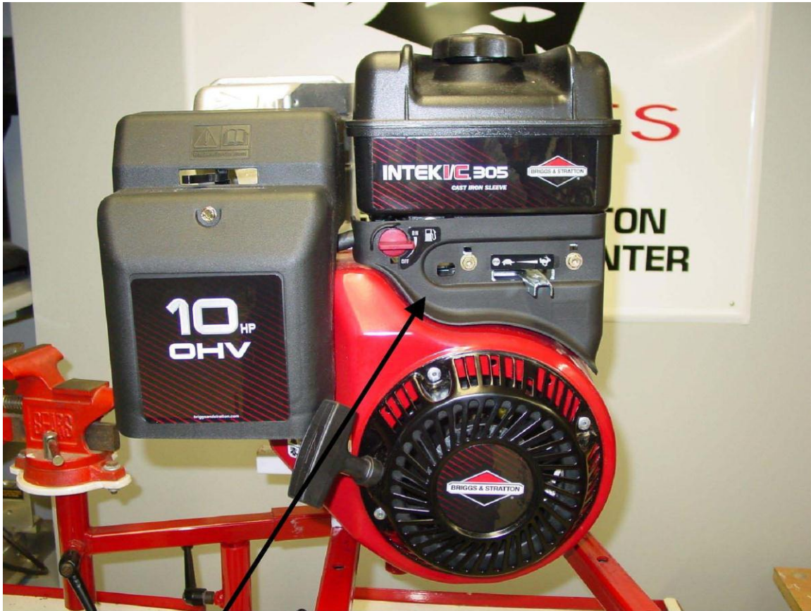
Remove Trim Panel

Remove trim panel. First turn fuel valve to the off position. Then remove 3, 5/16" hex head screws, two are located on the front of the engine and one is located on the side of the engine.